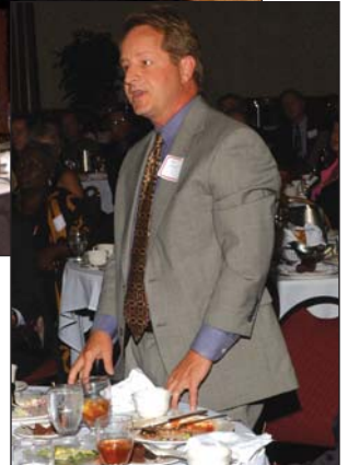
Following the panel discussion, the audience got its chance to ask questions.