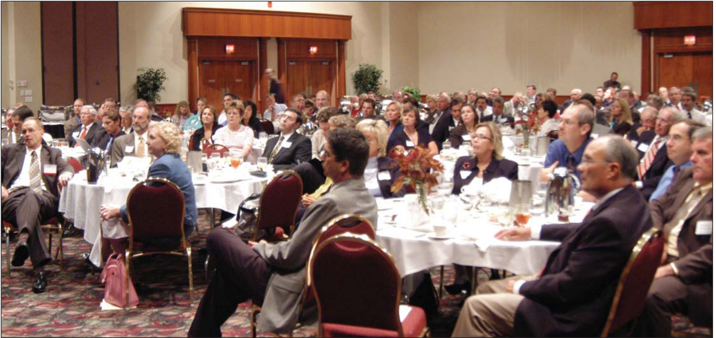
More than 200 attendees – the largest turnout ever for a Forum viewpoint luncheon – heard strong support for the continued and expanded use of TIFs to foster regional cooperation and economic development.